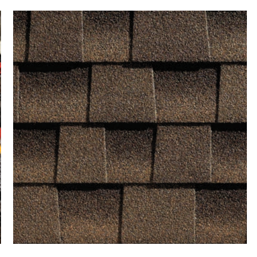
Beautiful finished look It's the same Timberline® Shingle you know and love, now even better